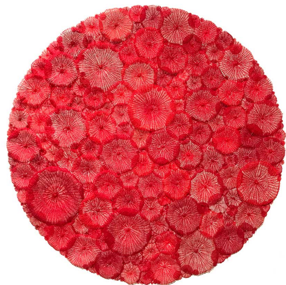
Image: Meredith Woolnough, The New Neighbours , 2017, Polyester Embroidery thread, Dimensions variable, 400+ individual embroideries pinned to the wall (shown install size 135cm diameter circle)

MAKE: Find an interesting image of a piece of coral. Draw it as many times as you can on a piece of paper. Switch between different colours, turn the paper and overlap your drawings to create your own living coral reef illustration.