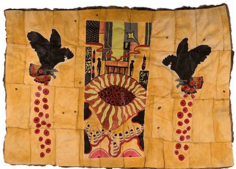
IMAGE: Treahna Hamm, Yakapna biganga (family possum cloak) , 2017, ochre, acrylic paint, synthetic string, possum pelts, 180 x 120 x 3cm.

MAKE: Call up someone from your family and ask them to tell you a story about your family or from when they were growing up. Create an artwork about the story using symbols. Your symbols might be animals, shapes, objects or patterns that might be meaningful to your family, their culture and stories.